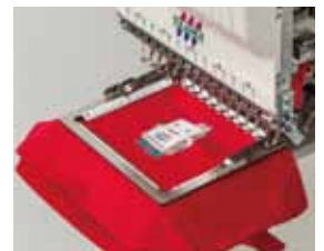
▲Air type Clamp