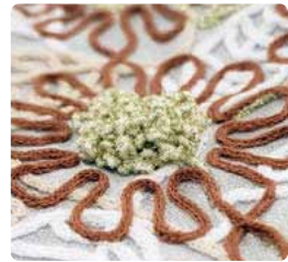
Embroidering 6 various types/colors of cords