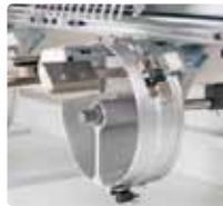
Reinforced Wide Cap Frame