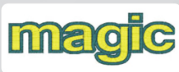
Borders for Text