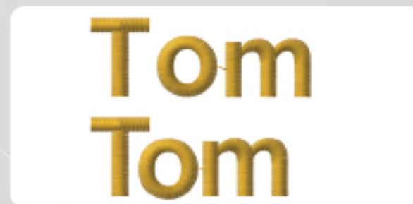
Auto Kerning Wizard