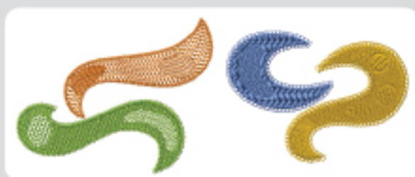
Complex Fill Modifier

Advanced vector functions, productivity enhancing features, and specialty stitch effects.